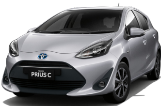
● Silver Pearl 6 1F7