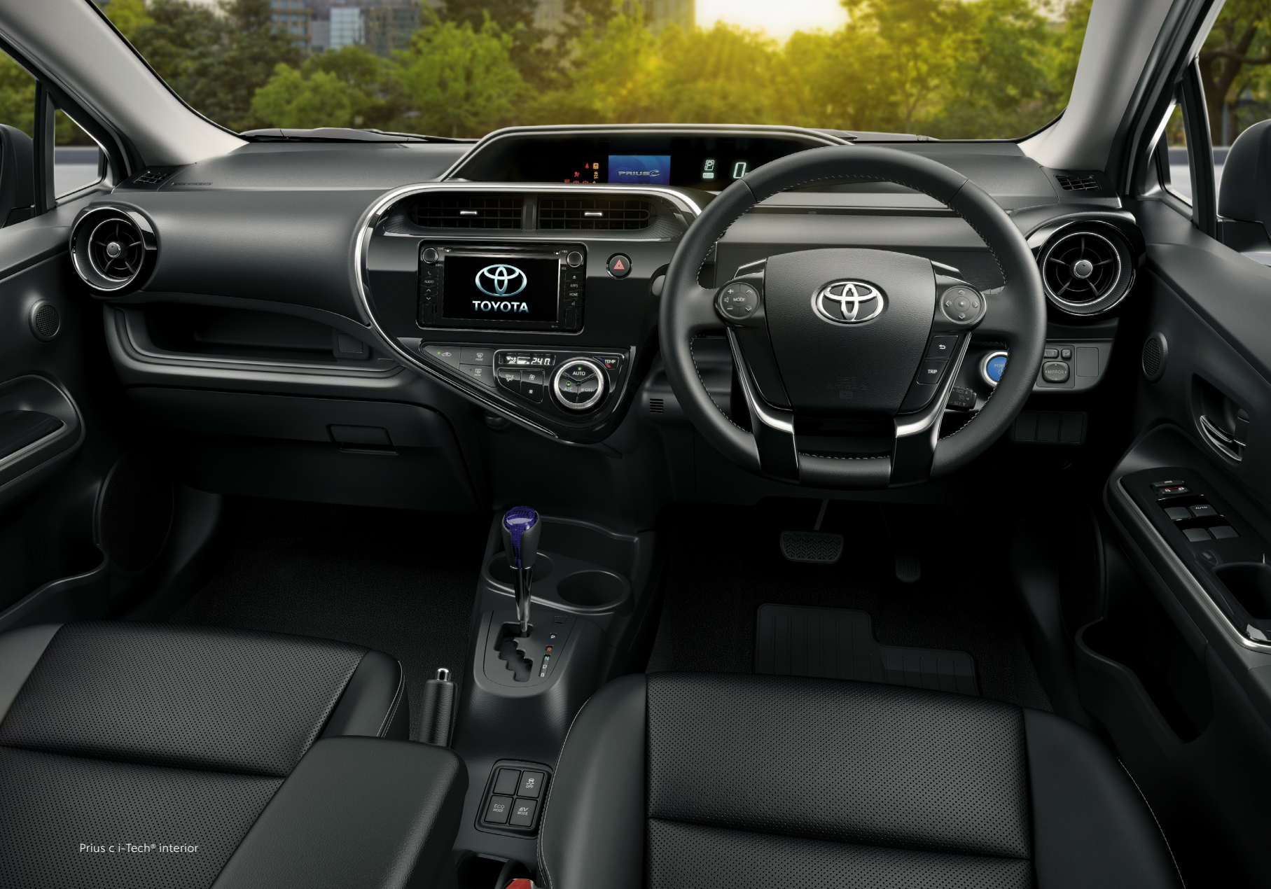
Prius c i-Tech® interior