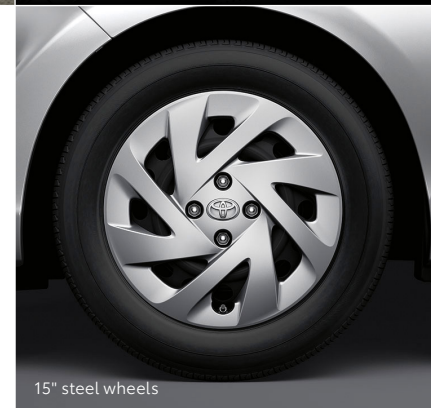
15" steel wheels