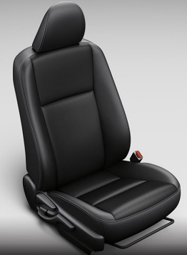
Premium seats and trim