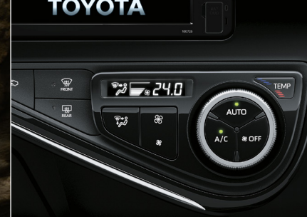
Automatic climate control air conditioning