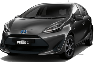
● Graphite 6 1G3