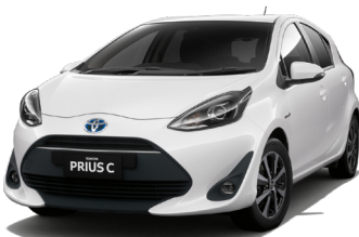
○ Glacier White 040