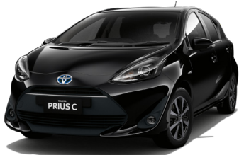
● Ink 6 209