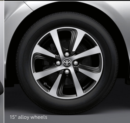
15" alloy wheels