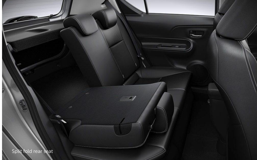
Split fold rear seat

With Prius c, focusing on the future is always in fashion.