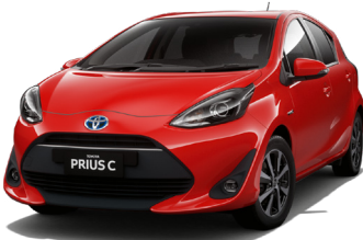
● Cherry 3P0