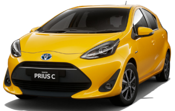
● Hornet Yellow 5A3