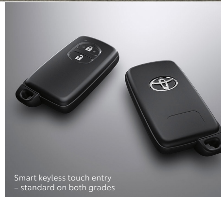
Smart keyless touch entry – standard on both grades