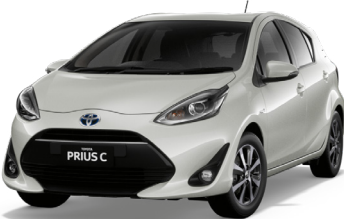
○ Crystal Pearl 6 070