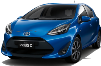
● Tidal Blue 6 8T7