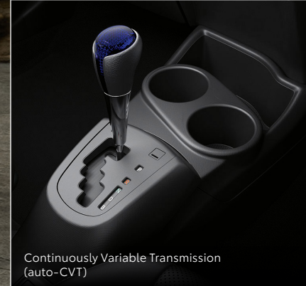
Continuously Variable Transmission (auto-CVT)