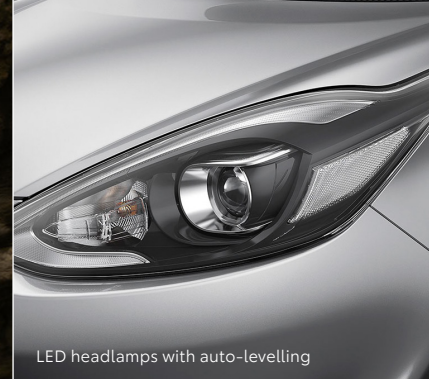
LED headlamps with auto-levelling