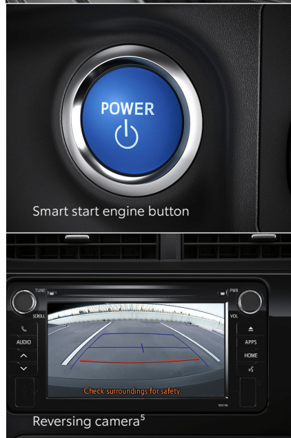
Smart start engine button