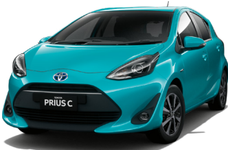
● Aquamarine 6 792